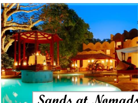
Sands at Nomads